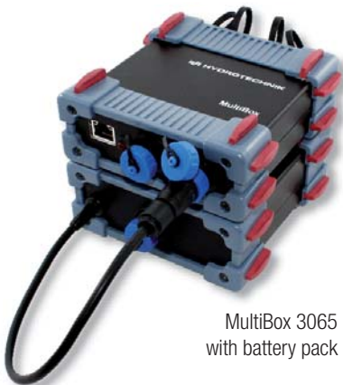
MultiBox 3065 with battery pack

Measuring cables are contained in the chapter „Accessories“